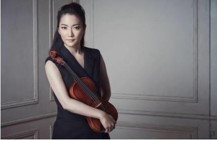
Akiko Suwanai

Click the thumbnails to download press images [Or hold Ctrl then click to open the file]