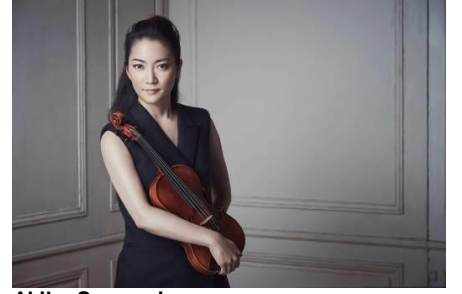
Akiko Suwanai